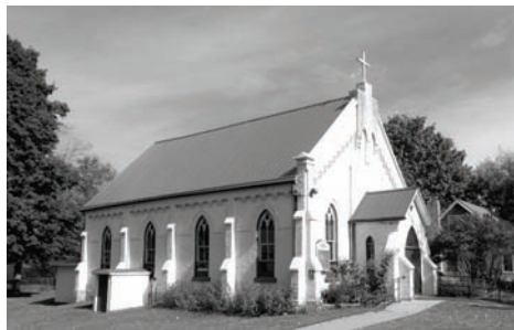
SACRED HEART - WARMINSTER