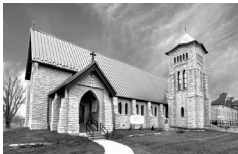
ST. ANDREW'S - BRECHIN