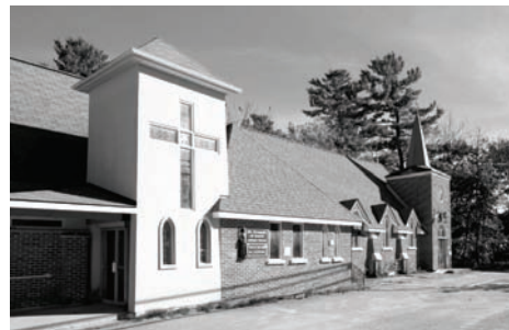
ST. FRANCIS - WASHAGO