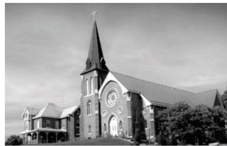
ST. COLUMBKILLE - UPTERGROVE